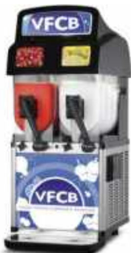
Soda Slush Machine / Frozen Carbonated Beverage Dispenser