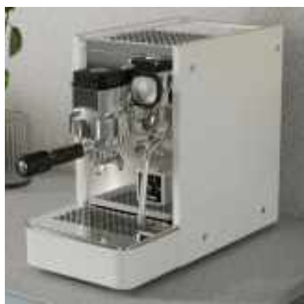
Stone Lite White

compact size semi-automatic espresso coffee machine suitable for small and medium businesses, made in Italy