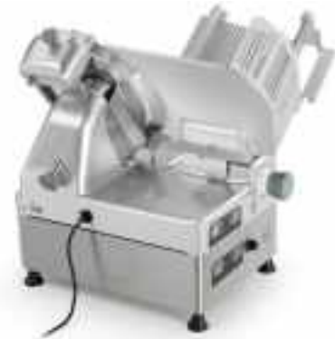
Palladio 350 Automec Frozen