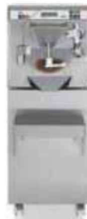
Ready 20 30