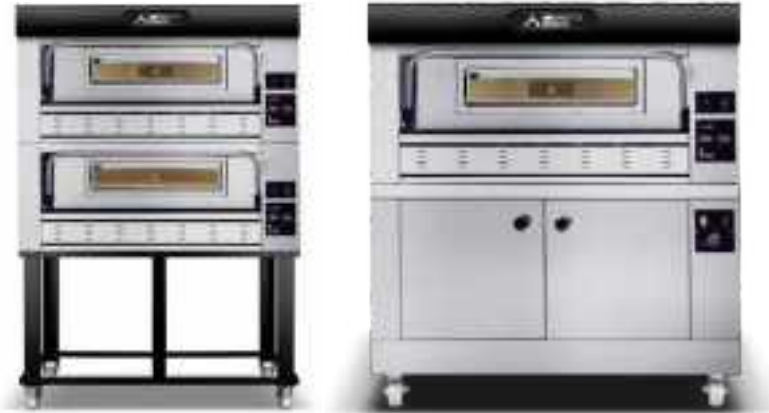
Deck Oven Series