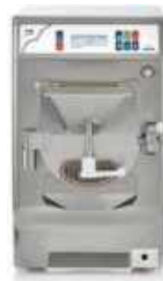
ReadyChef 14 20