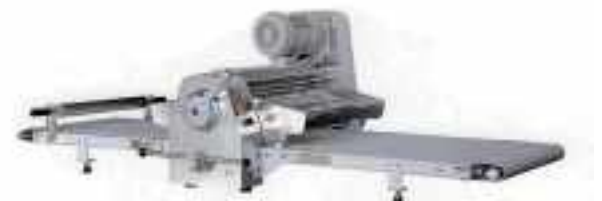
TTDS-450 / TTDS-520