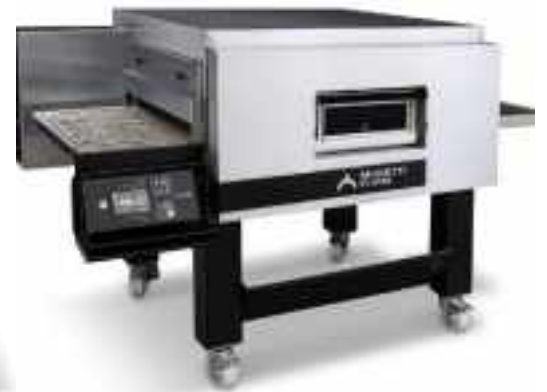
T Conveyor Series