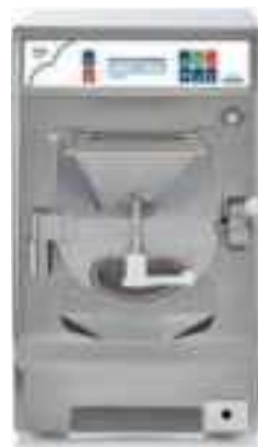
Ready 14 20