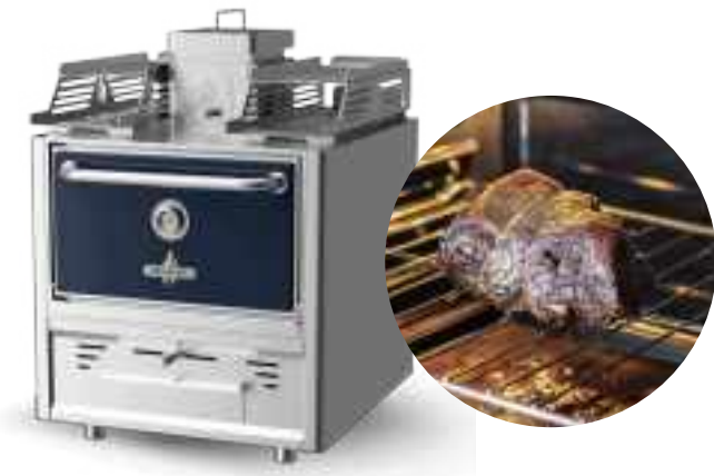
R56 Charcoal Oven

Charcoal oven and charcoal cooking equipment from Greece. Roaster charcoal ovens operates purely using charcoal and natural airflow to maximize the fire and heat, made possible with the oven design to allow the most efficient air circulation. Charcoal ovens make products to smell very nice, juicy inside with excellent outside finish while maximizing the food yield, delivering a unique kind of cooking that cannot be done with any other equipment.