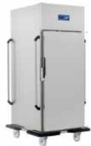
GNB 500 NMV