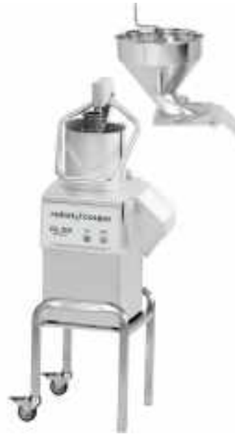
CL55 2 Feed-Head