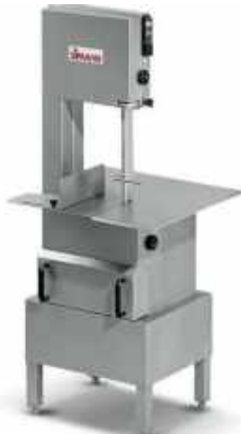
SO 2400 INOX