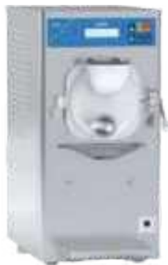
Labo 8 12 XPL P