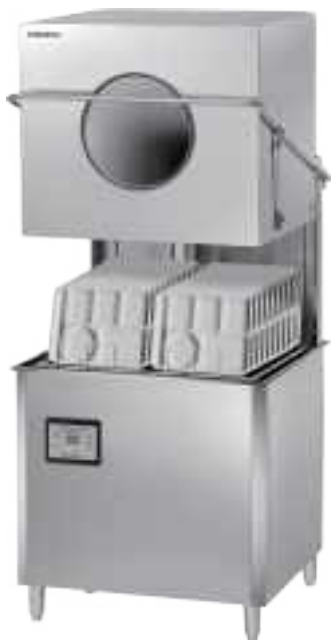
PDX-1001 (Hood Type)