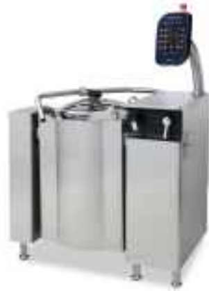
PROVENO Electric Mixing Kettle