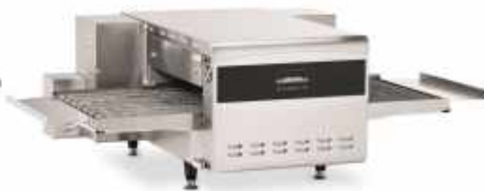
THE CONVEYOR C2000