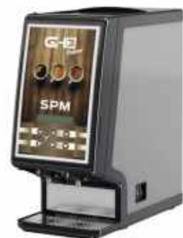
Hot Powder Beverage Dispenser