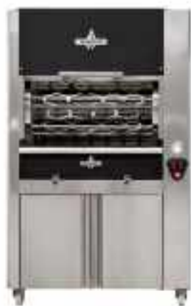
CFW12 Charcoal Rotisserie