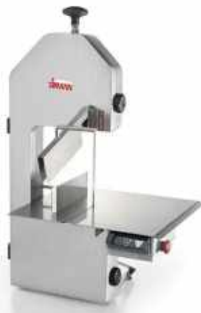
SO 1650 F3