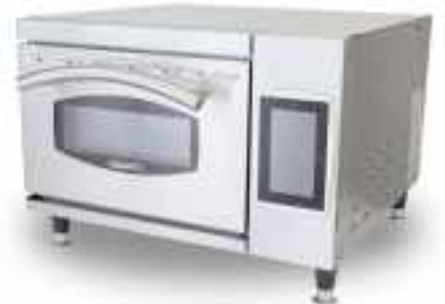
Single MiLO®-16 Oven