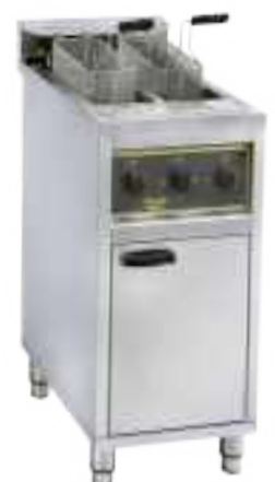
RFE 20 C