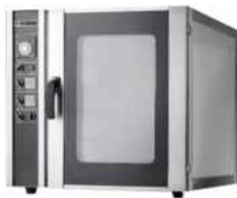
PCOVEN-5E / PCOVEN-5G