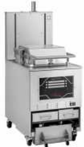
OXE-100 / PXE-100