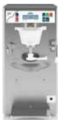
Ready 8 12