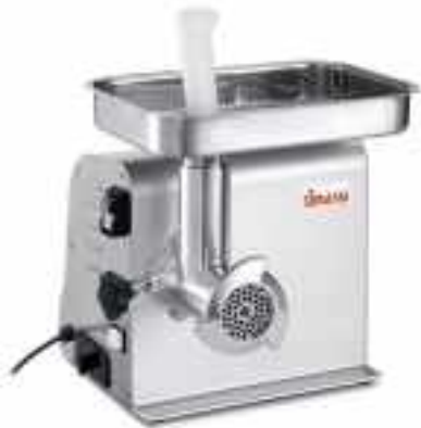
TC 12 Denver