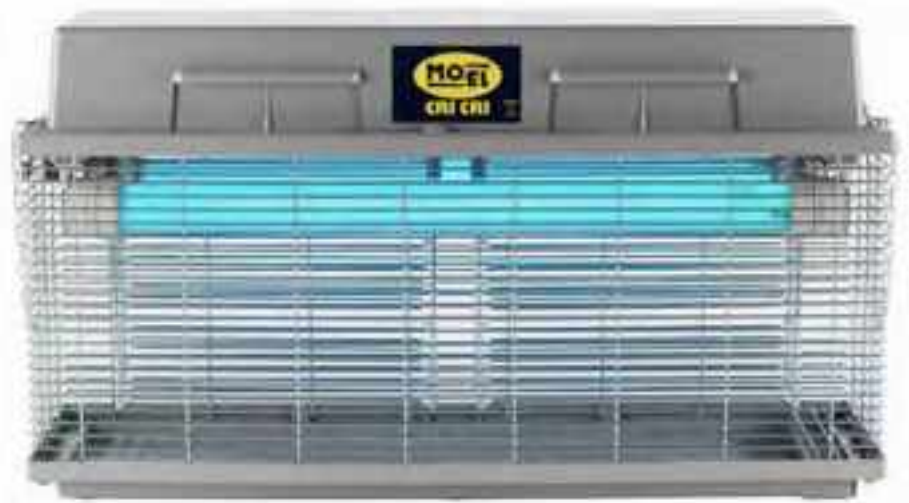
Mo-El ART-308E electric insect killer

MO-EL ART-308E has an irradiation efficiency of 15-18 meter radius, or equivalent about 1,000 meter square area. It is highly useful effective for eliminating insects indoor and outdoor, including kitchens, restaurants, seating areas, gardens, tennis courts, and many more. One unit of MO-EL ART-308E is more effective than dozens of common insect killers combined.