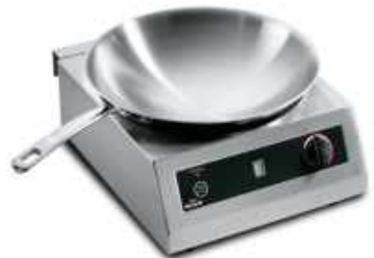
IH 35 WOK

Vacuum Packaging Machine With High Precision Programming And Water Detection System For Liquid