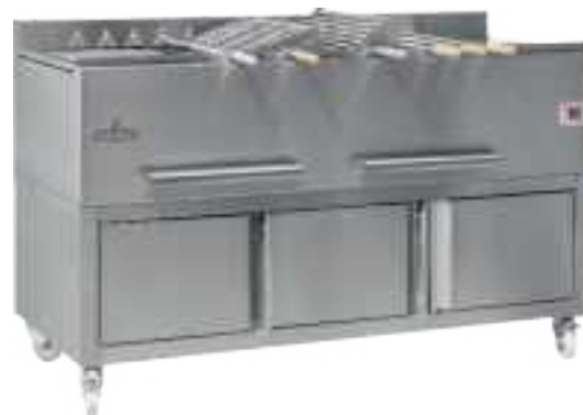
K13SF Charcoal Churrasco Grill