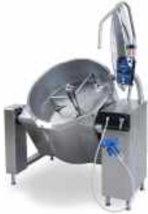
MIXPAN Electric Mixing Pan

The only industrial grade kettles and bratt pans in the market. 100% made in Finland. 100+ years of history. High production, high durability, high consistency, high everything. Strong and reliable mixing function with highly adjustable speed for the mixing kettles and mixing pans.