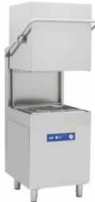
OBM 1080M R