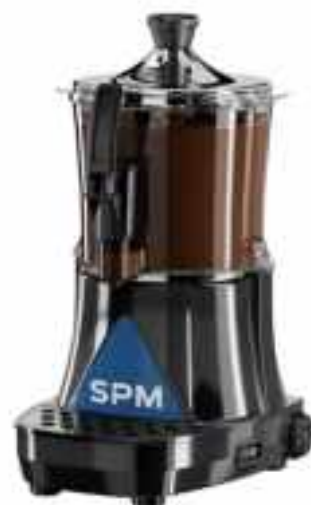
Hot Chocolate Dispenser