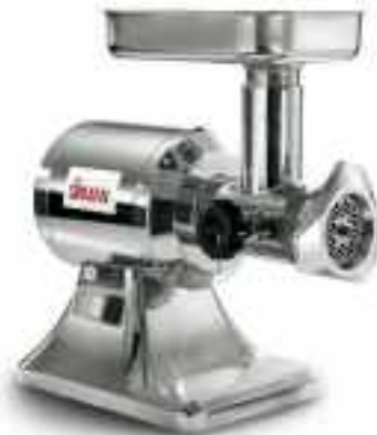
TC 22 E