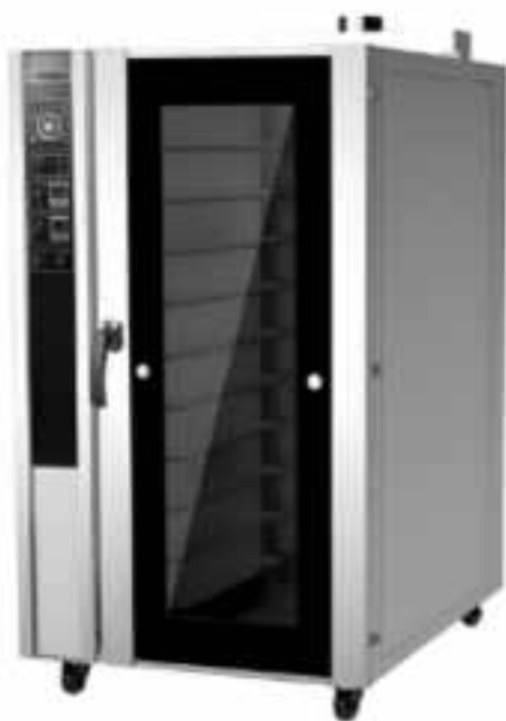
PCOVEN-10E / PCOVEN-10G