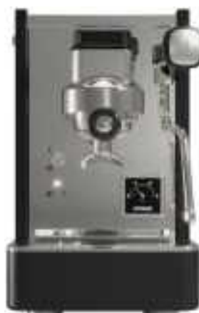
Stone Lite Black