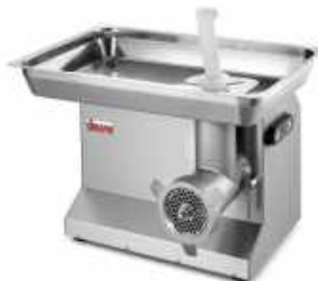
TC 32 COLORADO