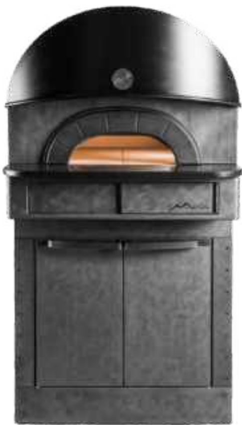
Neapolis 4 & 6

NEAPOLIS is an electric dome type pizza oven, designed to mimic the performance and baking results of gas and wood-fired pizza ovens but without all of the hassles. Electronic temperature control with 20 programs for accurate and easy heat control, no more guess works due to unstable heat from open flame. Cooler kitchen and energy saving, no more hot air around the oven, making working much more comfortable and air conditioner cost much lower in the kitchen. Biscotto brick baking surface for perfect heat distribution, finish making pizzas just barely over a minute or two depending on the pizza type. Max temperature of 510°C which makes it suitable for making Neapolitan pizzas.