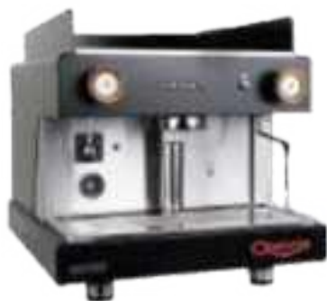
Indigo EVD 1