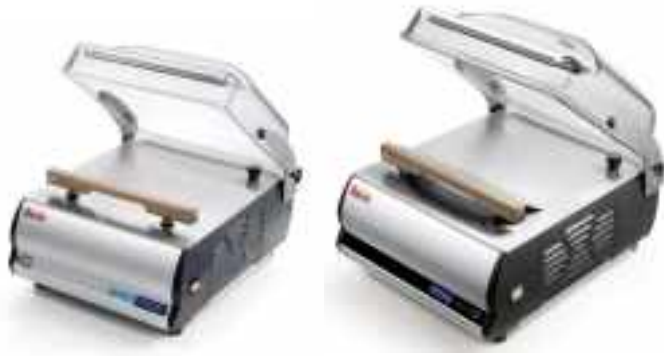
W8 30&40 Easytouch DX