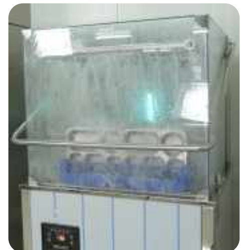
Extra wide hood type with glass panel