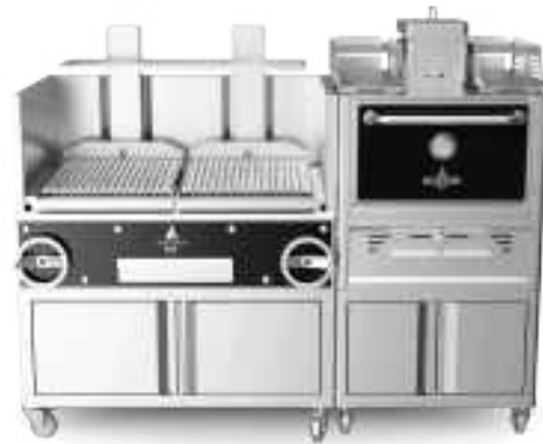
GP2GC & ROC56, Parilla Grill & Charcoal Oven