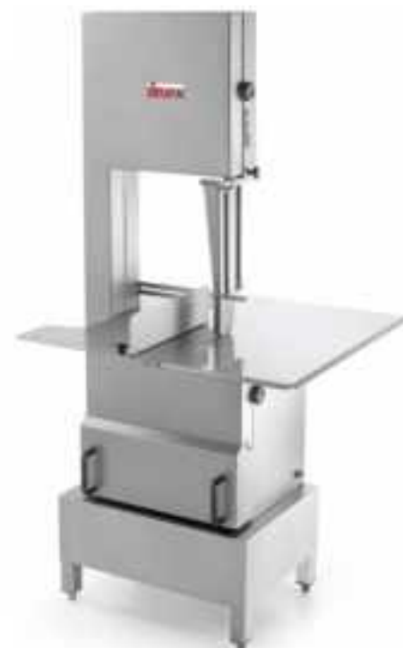
SO 3100 INOX