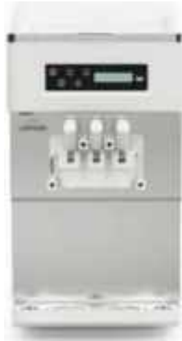
243 T SP