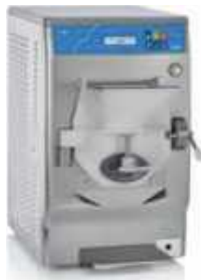
Labo 14 20 XPL P