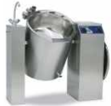
VIKING Electric Kettle