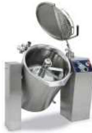
METOS VIKING COMBI