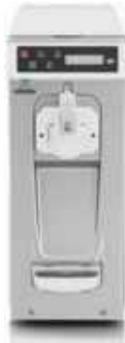
161 T GSP