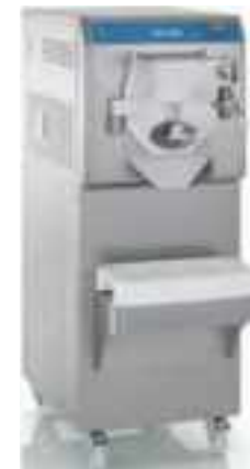
Labo 30 45 XPL P