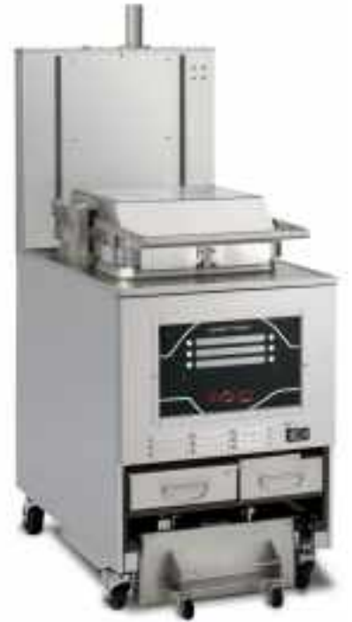
OXE-100 / PXE-100