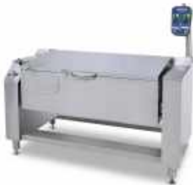
METOS FUTURA HD