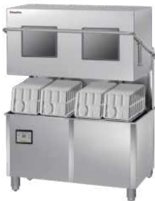
PDX-1005 Extra wide hood type for tray washing