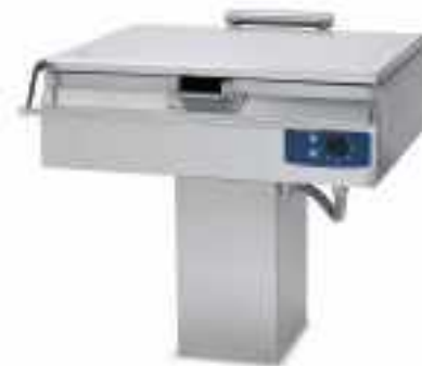
PRINCE Electric Tilting Bratt Pan